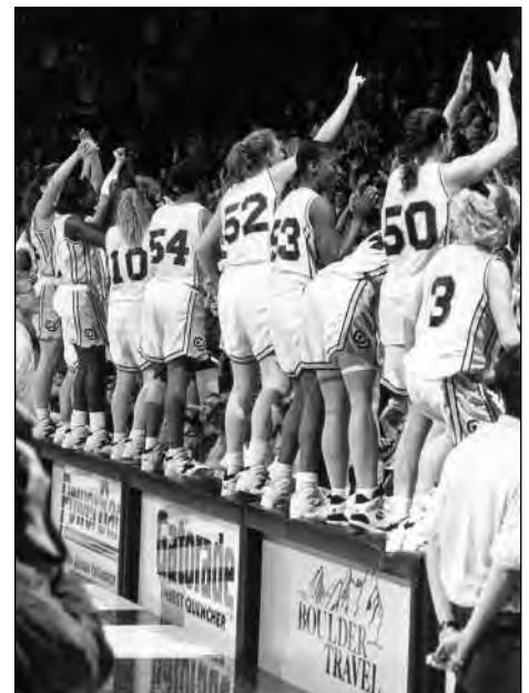
CU celebrates another NCAA Tournament win.