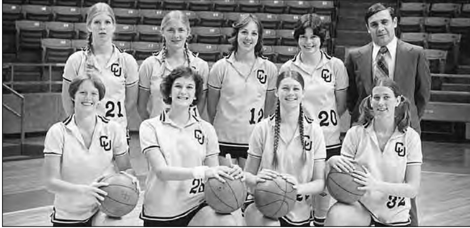
Colorado's 1977-78 team was its winningest to date, with an 18-14 mark.

of the most formidable women's basketball conferences in the country.